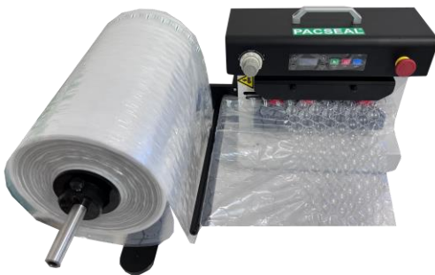
Air Column & Bubble Type