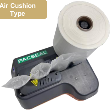
Air Cushion Type

PACSEAL Air Cushion & Bubble Packaging System are suitable for all protective packaging applications for shipping, logistics and transportation uses. Air pillow cushions, bubble and columns are available in various widths and lengths to suitable most applications.